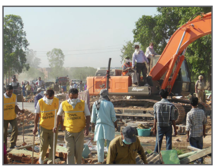
DEMOLITION IN CHANDIGARH

Between January and August 2015, HLRN estimates that over 9,000 families have been evicted forcefully across India.<sup>23</sup> In August 2015, the Indore Municipal Corporation forcefully evicted 1,500 families living in Chander Prabhas Shekhar Nagar while in June 2015, the Delhi government demolished homes of 500 families living along the River Yamuna, following the implementation of an order of the National Green Tribunal related to river banks.<sup>24</sup> Mumbai witnessed two major evictions in June 2015. Officials of the Brihanmumbai Municipal Corporation demolished about 1,000 homes in Malvani, Malad. The demolition was carried out in spite of assurances given by the forest