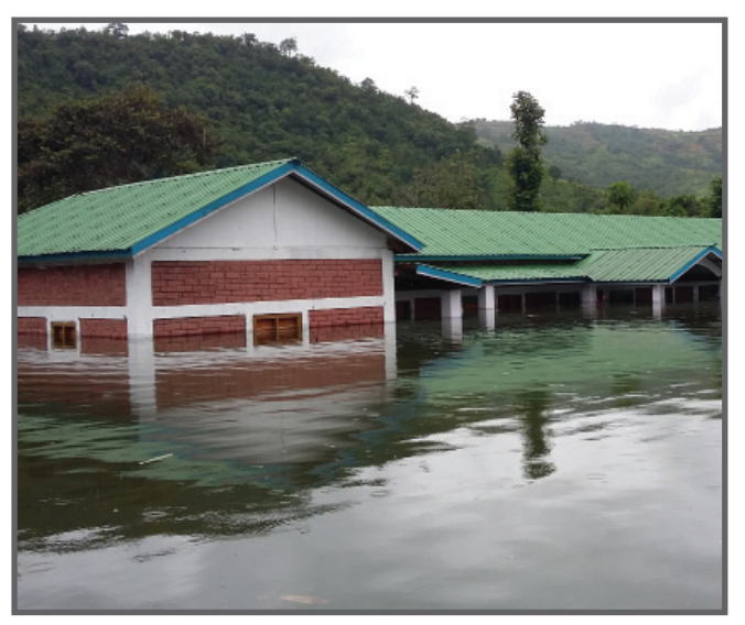
SUBMERGENCE OF CHADONG HIGH SCHOOL AT CHADONG VILLAGE, MANIPUR, FROM THE MAPITHEL DAM

Mapithel Dam is a project of the Irrigation and Flood Control Department of the Government of Manipur. Located on the Thoubal River in Ukhrul district of Manipur, the construction of the dam commenced in 1989. On completion, the project is expected to submerge more than 3,000 acres of land, almost half of which is under forest cover,<sup>59</sup> and will affect 8,000 people in 22 villages in the district.<sup>60</sup> In November 2013, the National Green Tribunal halted construction of the dam on the ground that the project did not have the required environmental clearances from the Ministry of Environment, Forest and Climate Change and stated that in order to resume construction, the state government would be required to present evidence that the project does not infringe on the rights of indigenous and tribal peoples in the area, under the Scheduled Tribes and Other Traditional Forest Dwellers (Recognition of Forest Rights) Act