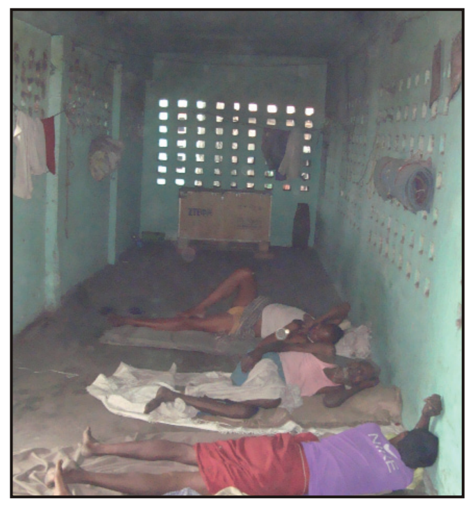
HOMELESS SHELTER IN PATNA, BIHAR

In January 2010, the High Court of Delhi initiated a suo moto case<sup>9</sup> on the issue of homelessness in the nation's capital. After five years, 100 hearings, and over 85 orders from the Delhi High Court, while the city has witnessed significant improvements in the number of homeless shelters (from 17 to 266) and a greater awareness within the government of