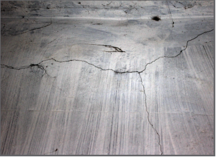
POST-TSUNAMI HOUSING IN PERUMBAKKAM, CHENNAI: CRACKS IN THE FLOOR

Government of Tamil Nadu used the Coastal Regulation Zone (CRZ) rules to refuse financial support to any family that rebuilt its home on the coast within 200 metres from the High Tide Line (HTL). The government permitted reconstruction of homes located between 200 metres and 500 metres from the HTL. If a family was willing to move beyond the 500-metre boundary of the CRZ, irrespective of whether their house had been damaged in the tsunami or not, the state government was willing to provide them with a new dwelling unit and three cents of land.<sup>101</sup> Violations of the CRZ Rules, however, are rampant, especially with regard to hotels and other establishments that are permitted to build near the coast.