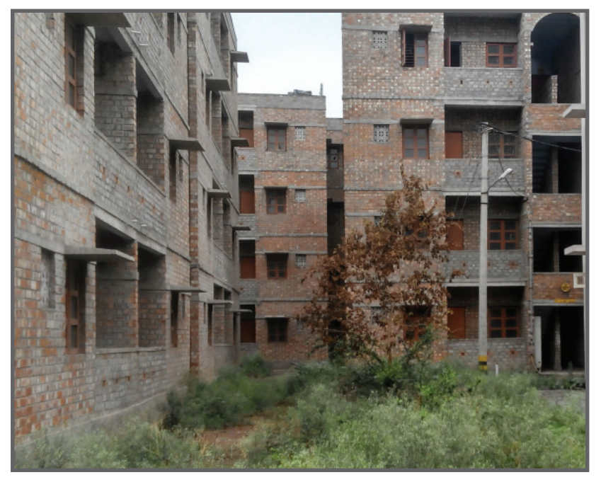
DETERIORATING CONDITIONS AT BAPROLA RESETTLEMENT SITE, DELHI

Despite accepting the failure of the resettlement model in Chennai, the Government of Tamil Nadu is in the process of completing construction of a large resettlement site at Perumbakkam. The site will have 23,864 houses, and when completed will be almost double the size of Kannagi Nagar, an existing large resettlement site that has multiple problems. Though the state set up a high level committee in the year 2011 to formulate a policy, till date, there is no policy in Tamil Nadu governing rehabilitation and resettlement.