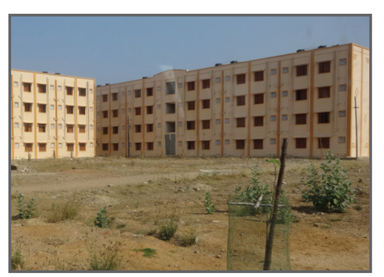
ETRP POST-TSUNAMI HOUSING IN EZHIL NAGAR, CHENNAI

For non-ETRP housing constructed along the shoreline for fishing communities, the