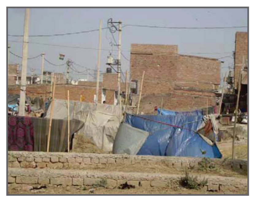
LIVING CONDITIONS AT SAVDA GHEVRA RESETTLEMENT COLONY, DELHI

Women and children suffer disproportionately from the impacts of forced eviction and failed resettlement. In many sites, the fear of violence prevents girls from attending school and young women from going to work. In some instances, it has also led to a rise in early marriages of girls of displaced families. Parents concerned about the safety of their daughters prefer to get them married rather than have them live on the streets or in other insecure locations. The distant location of resettlement sites from city centres and work places leads to many women losing their jobs. Those who opt to continue with their former jobs, in order to support their families, have to commute long distances daily, at great risk to their personal health and safety.