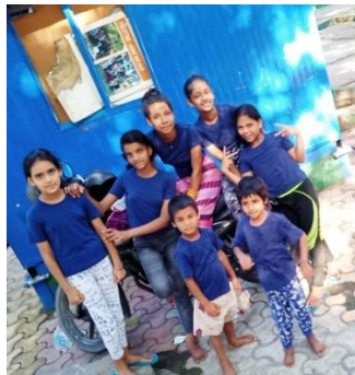
Distribution of clothes to homeless children by HLRN