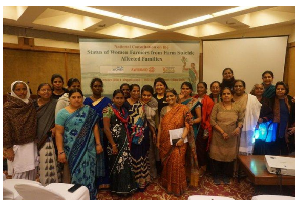
National Consultation on Status of Women Farmers from Farm Suicide-affected Families

As a member of MAKAAAM (Mahila Kisan Adhikar Manch or Women Farmers’ Rights Forum), HLRN supported a ‘National Consultation on Women Farmers from Farmer Suicide-affected Families’ in New Delhi in January 2020.