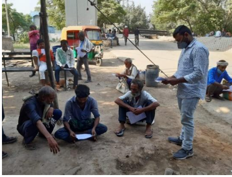
Small group Campaign meetings and dissemination of educational material by HLRN during the pandemic