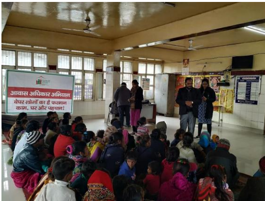
Campaign meeting at the Motia Khan shelter for homeless families in January 2020

The Campaign's demand for adequate housing became even more important during the COVID-19 pandemic, as homeless people and those without adequate housing have been disproportionately affected and face higher risk of contracting the virus. Through 2020, HLRN worked on disseminating information through various means and organizing consultations, including online, and one-on-one meetings with affected people across the city to create awareness on the human right to adequate housing, document needs and demands of homeless persons, and facilitate government action through sustained advocacy. As a result of the Campaign, homeless persons in Delhi are becoming increasingly aware about their right to housing and pushing for a 'Housing First' approach. One of the major achievements of the Campaign is that it has led to the creation of a people-centric platform. The Campaign has also succeeded in drawing attention of the government to issues related to homelessness and the need for providing adequate housing, beyond shelters.