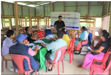
Manipur: Consultation with affected communities

Manipur: As a result of sustained advocacy, evictions were prevented in two communities, and an order prohibiting mining in the Maring area was passed. Several community meetings were organized in villages where people are faced with threat of displacement. Relief was provided to remote and marginalized communities during the lockdown.