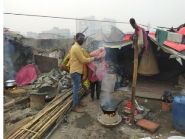
Relief for families affected by evictions in Bhovapur

In July 2020, 12 families living in Anna Nagar lost their homes to heavy rain, and were rendered homeless. As a result of continued engagement, efforts, and advocacy by HLRN, 10 of the 12 families received compensation from the government of Rs 25,000 each. We are continuing to advocate for alternative housing for the affected families. We arranged immediate relief, including blankets and food for families evicted in Bhovapur, Uttar Pradesh.