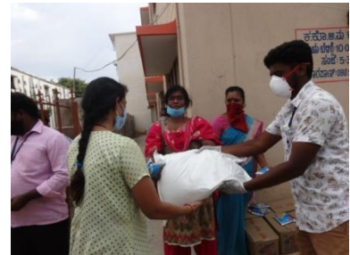
Bengaluru: COVID-19 relief

Delhi: A group of 30 homeless women living in Nizamuddin, Sarai Kale Khan, Urdu Park, and Kalkaji was created to enable them to effectively raise their demands. The women were also provided with awareness on their rights and relevant government schemes. Human rights education was provided in settlements threatened with eviction, and advocacy efforts and timely actions resulted in evictions prevented in five settlements. Relief, including cooked meals, milk, and dry ration, was provided to marginalized communities during the lockdown and after home demolitions.