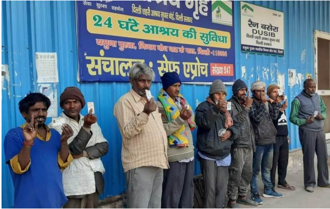
Homeless persons voting in the Delhi elections

For the eighth consecutive year, HLRN also continued to host and act as the Secretariat for Shahri Adhikar Manch: Begharon Ke Saath (SAM:BKS or Urban Rights Forum: With the Homeless) – a collective of over 20 organizations working on homelessness in Delhi, which HLRN was instrumental in creating in 2008.