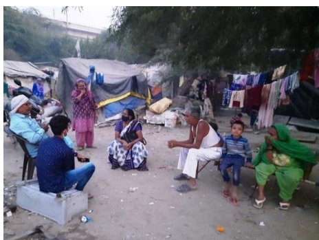
Meeting with residents of Shakur Basti

Housing and Land Rights Network, through its interventions, focuses on improving living conditions in low-income/‘informal’ settlements, including sites where evictions and demolitions of homes have occurred. In 2020, we worked closely with residents of various settlements in Delhi to improve their access to essential services, including water and electricity. These sites included Shakur Basti, Yamuna Khadar, Pul Mithai, Bela Gaon, Kanchanpuri, Gyaspur, Lajpat Nagar, Y-Block Nangloi, Bhim Nagar, Shahabad Dairy, Mullani Colony, Safdarjung Basti, and Malha Colony. For example, in Shakur Basti—a site that has witnessed multiple demolitions by the Indian Railways—with HLRN’s intervention, a long-term issue pertaining to the lack of adequate water was resolved. With help from the area legislator, HLRN got the seven non-functional hand pumps repaired and got four additional hand pumps installed. Now, eight water tankers are also providing water in the settlement.