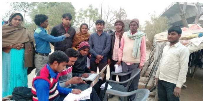
Delhi: Community survey with affected small farmers living along the banks of the Yamuna River