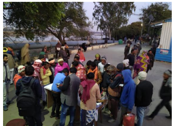
Homeless persons at Yamuna Pushta expressing their demand for adequate housing by signing a petition