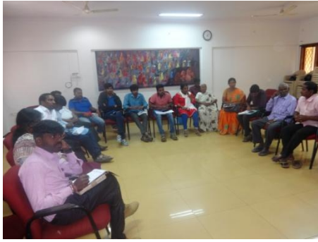
Workshop for community activists, Bengaluru