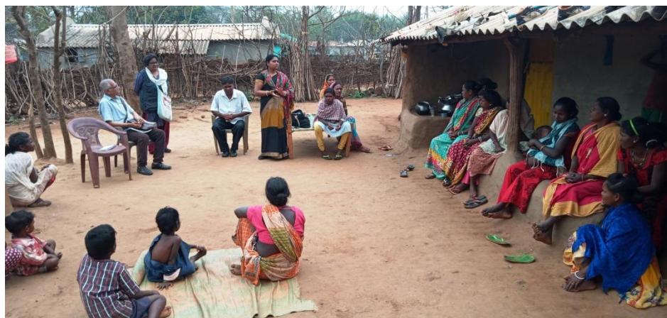
Assessing impact of contaminated water due to chromite mining in Sukinda Valley, Odisha