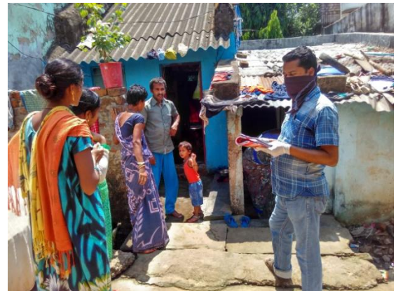
Odisha: Impact of COVID-19 lockdown on low-income communities: Survey in Sikharchandi, Bhubaneswar