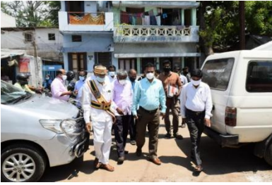
Meetings with government officials

Tamil Nadu: As a result of regular meetings with government officials and strategic advocacy, housing was provided to 280 families of sanitation workers and titles to land obtained for 20 homeless people in Madurai. Relief was also provided to 480 families affected by the COVID-19 lockdown.