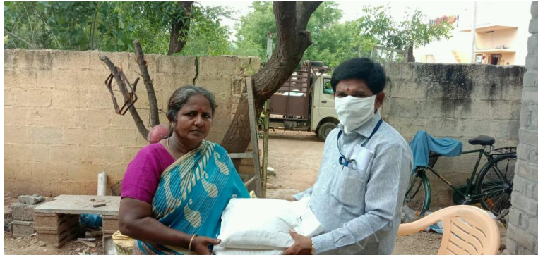
COVID-19 relief work in Madurai

Tamil Nadu: As a result of regular meetings with government officials and strategic advocacy, housing was provided to 280 families of sanitation workers and titles to land obtained for 20 homeless people in Madurai. Relief was also provided to 480 families affected by the COVID-19 lockdown.