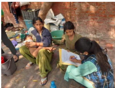
Delhi: Organizing homeless women

Delhi: A group of 30 homeless women living in Nizamuddin, Sarai Kale Khan, Urdu Park, and Kalkaji was created to enable them to effectively raise their demands. The women were also provided with awareness on their rights and relevant government schemes. Human rights education was provided in settlements threatened with eviction, and advocacy efforts and timely actions resulted in evictions prevented in five settlements. Relief, including cooked meals, milk, and dry ration, was provided to marginalized communities during the lockdown and after home demolitions.