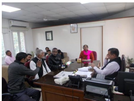
Meeting with the Delhi Urban Shelter Improvement Board to improve living conditions in resettlement sites

Strategic interventions and collaborative efforts with residents of resettlement sites of Baprola and Dwarka in Delhi, and Perumbakkam in Chennai helped residents access improved services, including roads and sanitation systems, during the pandemic. For instance, with advocacy efforts of HLRN, a tender was passed and work related to plumbing, water, and sanitation was completed in the resettlement site of Dwarka, Delhi.