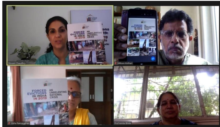
Experts launching HLRN's report on Forced Evictions in India in 2019

A recording of the launch event and panel discussion is available at HLRN's YouTube channel: https://www.youtube.com/watch?v=IWZ_i0VkdaM