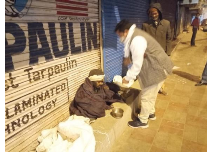
Distribution of sweaters and blankets by HLRN to persons experiencing homelessness in Delhi

During the year, HLRN also worked to ensure that the following facilities were available in all homeless shelters: