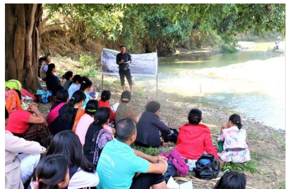
Manipur: International Rivers Day consultation to protect indigenous rights