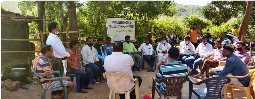
Odisha: Community human rights education workshop

Odisha: Consultations with communities affected by forced evictions and joint advocacy efforts resulted in several actions being taken for justice. Human rights education events were organized in various communities in cities and villages, including forest-dwellers, resulted in improved awareness on laws, schemes, and human rights. Over 25 petitions were filed with national and state human rights commission on issues related to violations of housing and land rights.