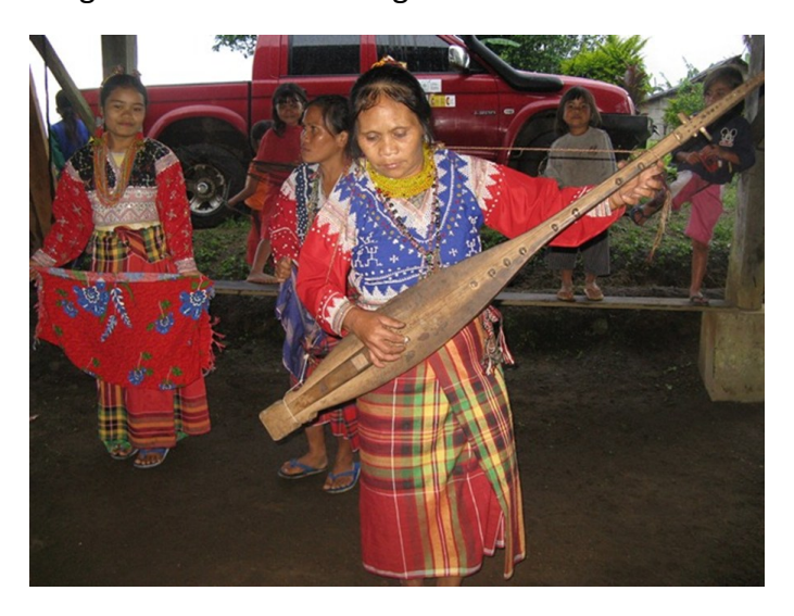
B'laan women of Southern Mindanao performing their B'laan Dance Ceremony.

Sadly, "big development" is encroaching on indigenous peoples' customary lands throughout the region, threatening their cultures as well. These lands occupy forests and mineral-rich lands coveted bv commercial and governmental interests. Large-scale projects like hydropower dams in Nepal and mining operations in the Philippines result in forced evictions. In Cambodia, about 2.66 million ha of indigenous peoples' land have been granted to or reserved for private companies. Laws purporting to protect indigenous peoples' rights often conflict with other laws that come in the guise of "national development."